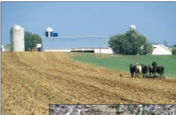
Residue is managed in many ways.