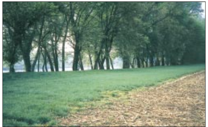
Riparian Forest Buffers