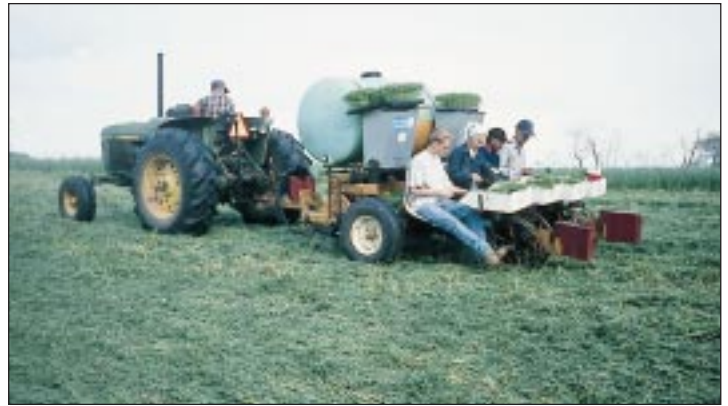
No-tilling vegetables into cover crop.