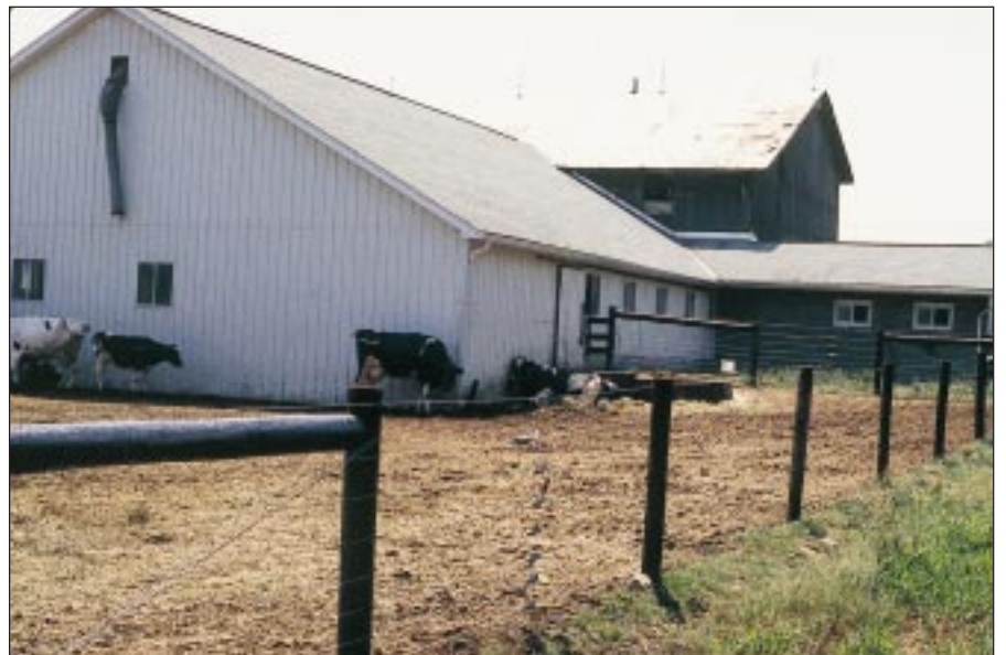
One year later