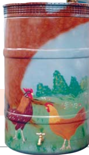
Rain barrels may be painted to increase their aesthetic value.