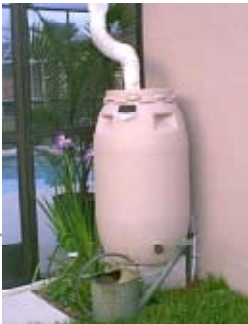
This barrel was painted to match the house color.

Outdoor acrylics and spray paint work well, but the barrel must first be primed so these materials adhere properly to the surface. A product on the market is a spray paint designed specifically for outdoor plastic furniture, but it will work on almost any plastic surface. The benefit to this product is that the barrel does not have to be primed before applying the spray paint. If using spray paint but need to paint small details, spray some paint into a small cup, making a liquid puddle. This paint can be brushed on.