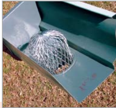
A window screen placed over the barrel opening (left) or a gutter strainer placed in the downspout opening (right) will keep leaves and other debris out of the rain barrel.