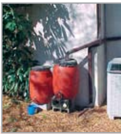
Gutters and downspouts funnel rainwater to the rain barrels.

Most storage tanks are placed above ground to take advantage of the force of gravity. A below-ground tank requires a pump to get the water out. This increases the cost and maintenance of the system.