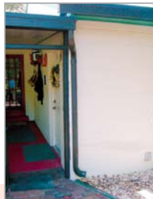
A good spot for a rain barrel.