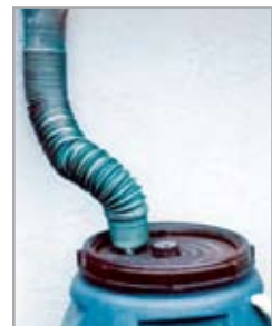
Flexible downspout extender