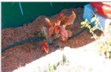
Attach a soaker hose to water nearby plants.