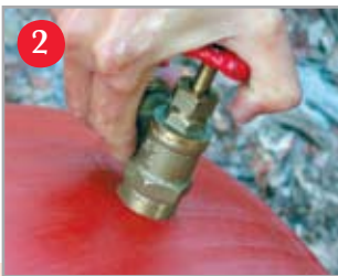
Next, screw in the hose spigot about halfway. Make sure the threading is going in straight, as this will help prevent leaking.