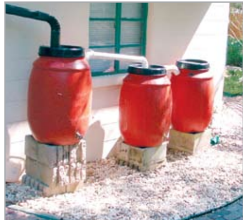
Multiple barrels provide for greater water storage.

Cisterns and rain barrels have been around for thousands of years and the time has come for more homeowners to enjoy their benefits.