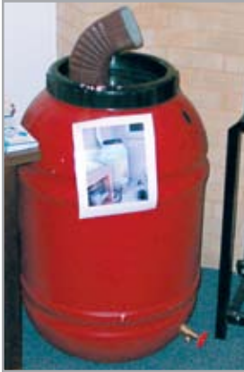
Hillsborough County Extension Service has a demonstration rain barrel.

Many county Extension offices have rain barrel demonstration exhibits where you can see examples of rain barrels that any homeowner can install. The Extension offices also provide an abundance of information on plants, gardening, composting and water conservation. Most county Extension offices offer workshops on all of these subjects.