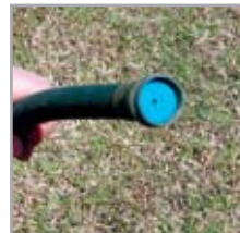
Remove the pressure-reducing washer from the soaker hose.