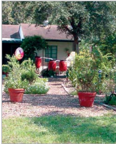
Rain barrels are one component of this water-efficient landscape.

Although a small rain barrel may not provide all the water needed to sustain your plant material, it can certainly supplement your current watering schedule. Planter beds, vegetable or flower gardens and potted plants can easily be irrigated with the water from a rain barrel.