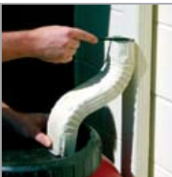
Mark downspout for cutting

To make the transition from the gutter/downspout to your opening in the rain barrel, you can fabricate a crosspiece out of downspout material or purchase a flexible downspout extender. The flexible downspout extender eliminates the need for exact measurement because it bends and stretches to the length you need. Make sure the downspout extender fits the size of your downspout.