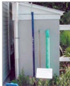
These cisterns at the Florida House Learning Center each hold 2,500 gallons of rainwater.