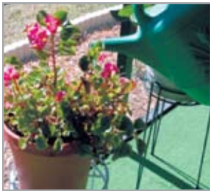
Hand water plants.

If using a soaker hose, take out the pressure-reducing washer to allow more water to flow through the hose ( bottom right ). Filling a watering can to water plants around the yard is always an option. You can also use the water to keep your compost bin moist or to rinse off gardening tools.