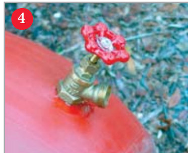
The rain barrel outlet is now complete.