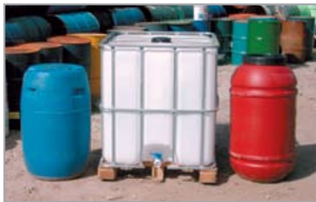
Some common containers used for rain barrels are (left to right): 50-gallon sealed barrel, 275-gallon juice container, 50-gallon open-top barrel.