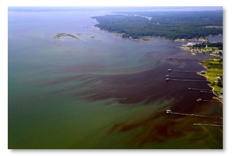
Algal bloom in the Chesapeake Bay.